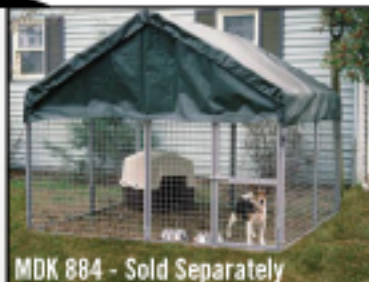
MDK 884 - Sold Separately