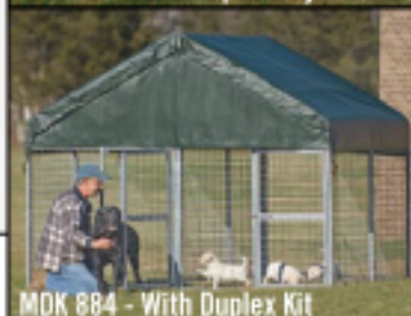
MDK 884 - With Duplex Kit