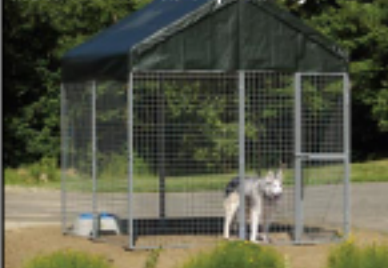
MDK 886 - With Duplex Kit